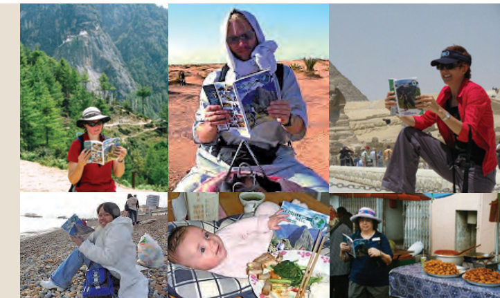
Our travellers regularly consult their book, Travelling Well.

Third , some vaccinations take time to take effect.